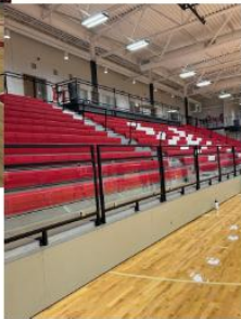
BLEACHERS ON THE LEFT—JUDGES AREA UP TOP