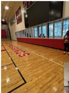
WINDOWS FROM FOYER LOOKING INTO GYM—T-SHIRT SALES WILL BE RIGHT IN FRONT OF THE WINDOW IN THE FOYER.