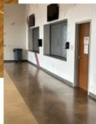
CONCESSIONS ON THE LEFT SIDE OF THE WINDOWS AS YOU ARE LOOKING IN.