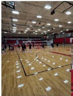
MAIN GYM—BLEACHERS ON LEFT—RIGHT AND SIDE/STRAIGHT AHEAD